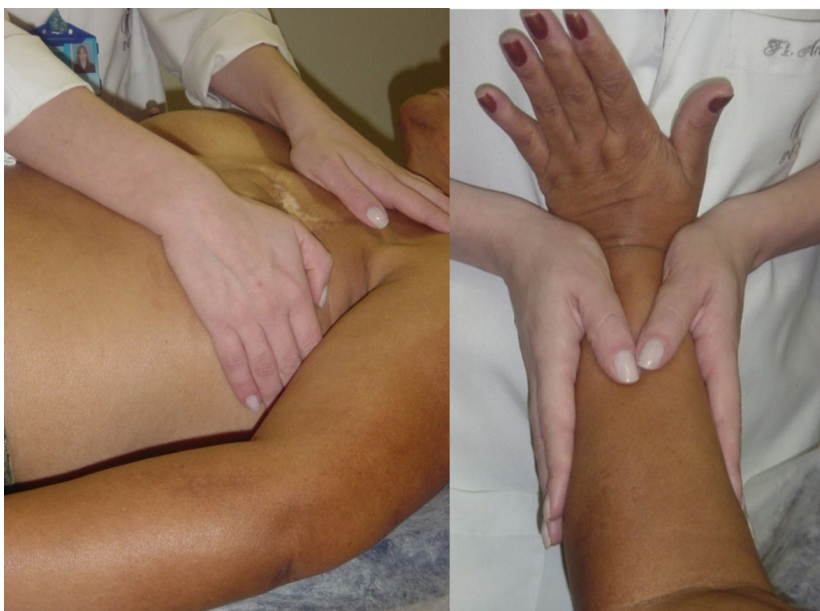
Figure 1. Manual lymph drainage in a patient with breast cancer-related lymphedema.

Its main objectives are to increase absorption of liquid and proteins from the interstitium by the lymphatic capillaries, increase the contractility of the lymphatic collectors, and increase liquid lymph node absorption, thus increasing the amount of liquid that