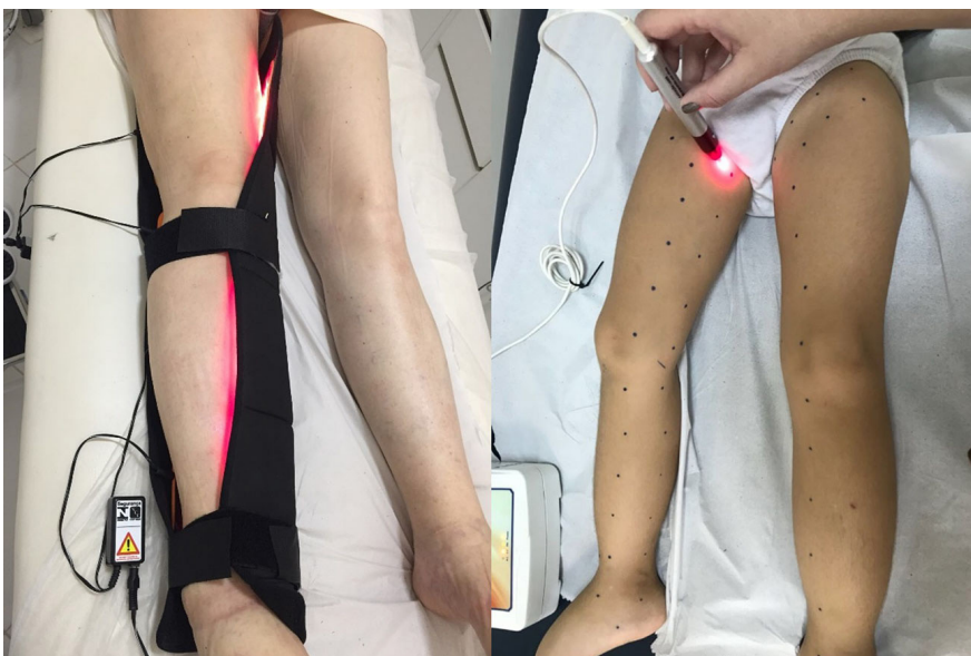
Figure 4. Photobiomodulation therapy in a patient with lower limb lymphedema.

Cialdai et al. 70 showed that irradiation with a high-power dual wavelength (808 nm and 905 nm) NIR laser did not affect the behavior of human dermal fibroblasts and breast adenocarcinoma cell lines in terms of proliferation, cell cycle progression, apoptosis, or cloning efficiency. These results are consistent with the possibility of safely administering NIR laser irradiation for management of secondary lymphedema due to cancer. 68