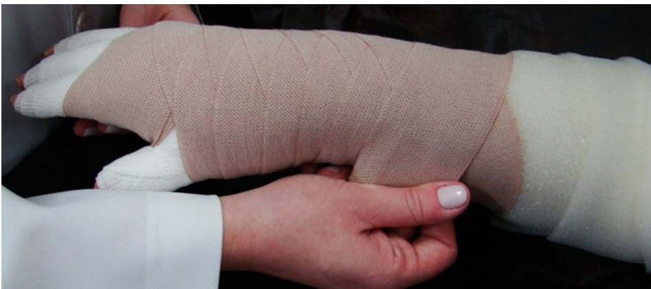
Figure 2. Multi-layer bandaging in a patient with breast cancer-related lymphedema.

Another option for compression therapy that can be used both in the reduction of limb volume phase and in the maintenance phase is adjustable compression devices. These consist of a garment made of low elasticity fabric that wraps around the